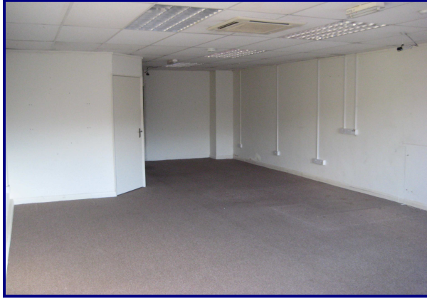
Internal View of the Retail Unit