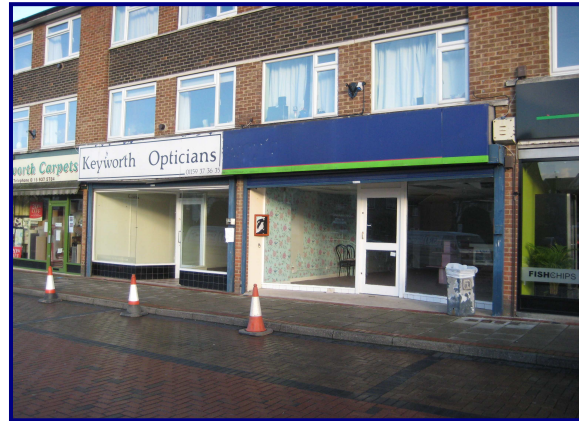
Double Unit 75 -77 Wolds Drive