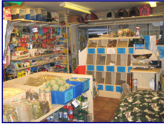
Internal View of the Retail Unit