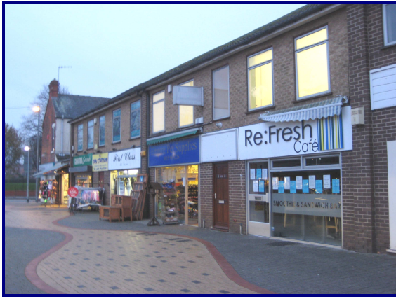
General View from Market Place