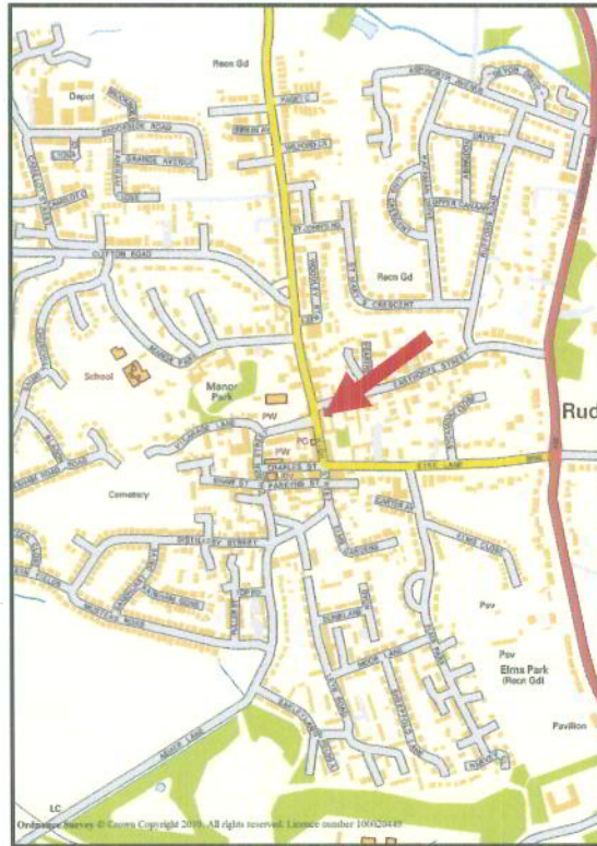
Location Plans (For Identification Purposes Only)